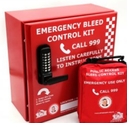
Locked Emergency Bleed Control Cabinet and Kit (optional)