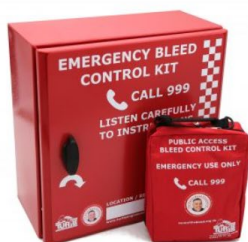
Unlocked Emergency Bleed Control Cabinet and Kit (optional)

There is variable costs depending on the type of kit and or unit purchased – see below. This includes a charitable donation of £5 per kit and £10 per cabinet towards the Daniel Baird Foundation. The Parish Council has no specific budget for this but could utilise £5,000 from the 2023-24 Youth Development budget.