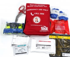
Emergency Bleed Control Kit – Daniel Baird Foundation

Control the bleed with our recommended kit